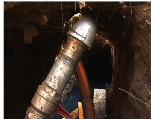
Fig. (6). Pilferage of oil during discharging of oil cargo.