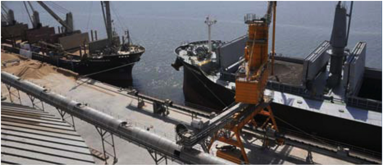
Fig. (2). Discharging operation at Karachi port.

cannot be brushed aside on the basis of a myth that due to the constant movement of the ship on account of the waves of the sea the ullages are entirely unreliable, as has been held in the case of Lady Helene [10]. The Collector of Customs challenged the said decision of the Division Bench in the Supreme Court of Pakistan in the case of Collector of Customs v/s Fatima Enterprise which was pleased on 4.11.2003 to direct that [11].