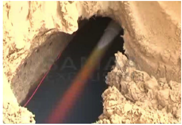
Fig. (4). Wastage of oil cargo from the underground pipelines.