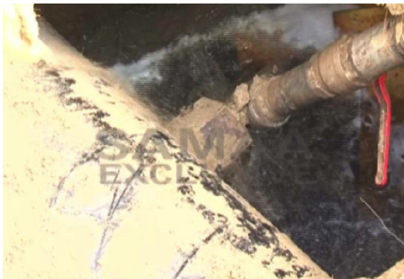
Fig. (5). Another view of leakage of oil from the shore pipelines.