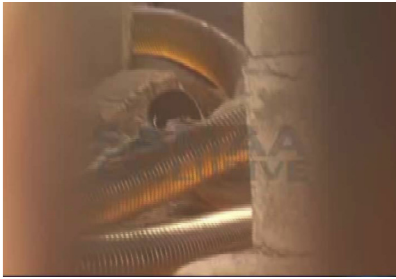
Fig. (3). Leakage from the pipelines at the port area of Karachi reported by the well known news channel of Pakistan.