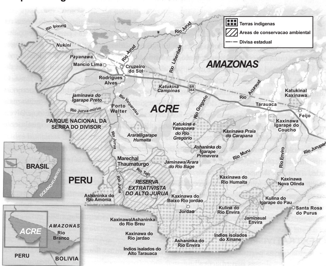
Fig. (2). Localization of Indian Lands Kulina do Rio Envira, Jaminawa-Envira and Kulina do Igarapé do Pau, in the Upper Envira River, State of Acre, Brazil.

dynamic, in constant process of adaptation and based in a structure of values, ways of life and mythical beliefs deeply rooted in the daily life of the indigenous peoples [26].