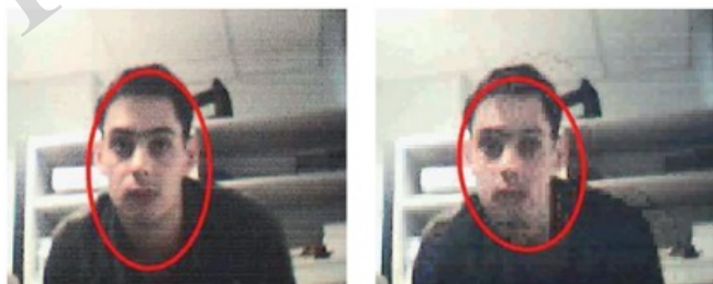
Fig. (2). A snapshot frame from a test video for CAMSHIFT face tracking. In (a) it is compressed with quality 100 and in (b) with quality 50.