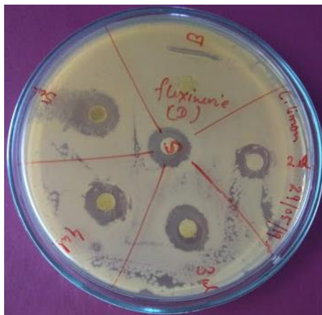
Fig. (1). One of the representative plates showing antimicrobial efficacy of C. limon fruit juice against S. flexneri . S (in centre) and B (on top) represents presence of standard drug i.e. ampicillin (25 \mu\text{g} , positive control) and DDW (negative control), respectively. The sections in the plate marked as 2, 3, 4 and 5 \mu\text{l} denote the concentrations of C. limon juice to be 100, 200, 300 and 500 \mu\text{g}/\text{disc} , respectively.

All data represent mean \pm SE of three independent experiments. '—' represents no inhibition zone observed for respective microorganisms.