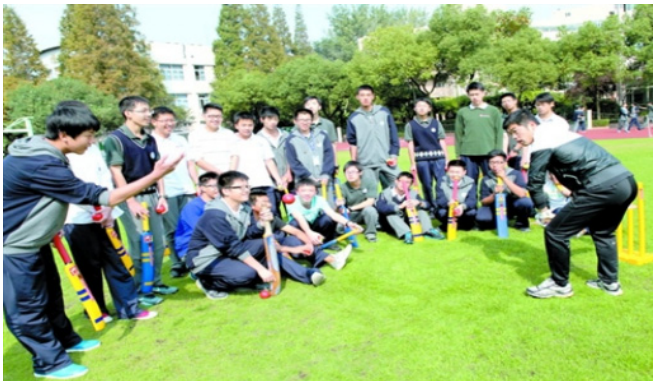
Fig. (1). Characteristics of physical education teacher-student interaction.

Physical education teaching is a special teaching method. The teaching process is a kind of teaching, learning and practice. Students through the process of practice, not only to master of sports and health care knowledge, technology and skills, also make the physical and mental exercise and development [8]. This teaching, interaction of teaching mode, makes it easier for the students and teachers to be integrated. It also laid the foundation of communication between teachers and students. The harmonious development of the relationship between teachers and students in physical education, but some teachers are not good at using this resource [9]. For example, in the end of the lecture, the demonstration layout of the task, do not take the initiative to integrate into the students, as shown in Fig. (1).