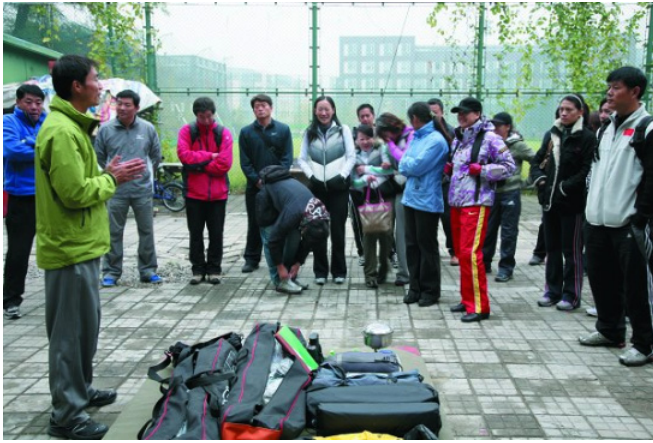
Fig. (2). Communication between teachers.