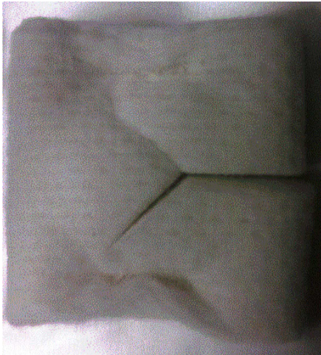
Fig. (1). An example of the QuikClot® Combat Gauze™ dressing.

changes at cannulation sites were needed less than three times daily.