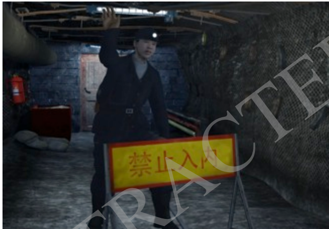
Fig. (3). Virtual work environment.

Firstly, build model for the virtual characters and the environment in this case, virtual work environment as shown in Fig. (3). Then perform animation for simulation aimed at mine workers' illegal behavior in this case, as shown in Fig. (4). At last, making animation to simulate the consequences arising out of the illegal operation, as shown in Fig. (5). It is showed that from the above diagram due to the illegal explosion by workers led to coal and gas outburst which caused the death of a co-worker. The system developed in this paper reconstructs the whole process of the accident, and displays the cause of the accident and prevention measures in the animation video, demonstrates the serious consequences of the accident and plays a warning.