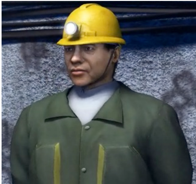
Fig. (2b). The characters of the virtual model.