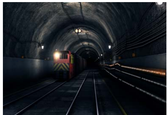
Fig. (2a). The virtual model of roadway.

The scenic environment of the 3D virtual simulation training system includes static roadway models, electromechanical equipment and dynamic personnel, mobile devices etc. This system adopts the geometric modeling method to build a static model of physical shape and size by using 3DMAX software, and then increase texture mapping, lights and shadows on the appearance of virtual model according to the corresponding material reference. For the entity model of complex and irregular shapes, we will trim the AutoCAD schematic of entity models, and then import it in 3DMAX, to construct the virtual model based on the contour of the entity model. Fig. (2a) depicts the virtual model of roadway. The virtual human modeling is based on geometric model and human body skeleton model. According to the analysis of the body's movement, modeling is based on non-uniform rational B-spline (NURBS) surface shape, combining with constructive solid geometry (CSG) to create the human body model [6]. As shown in Fig. (2b) for the characters of the virtual model.