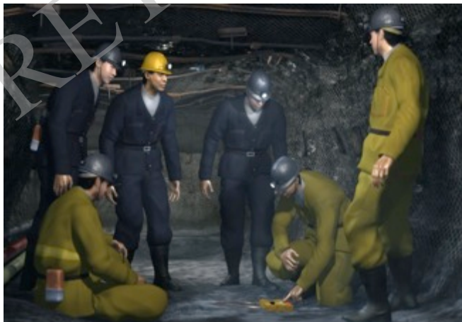
Fig. (4). Illegal behaviors.