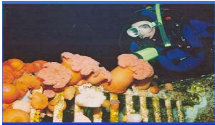
Fig. (4). A sunken ship, prepared specifically for divers to explore.