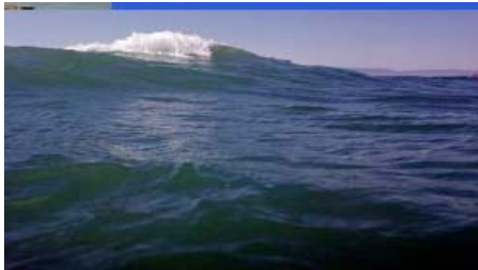
Fig. (5). Artificial reefs promote breaking of waves in situations where the surf would be poor.