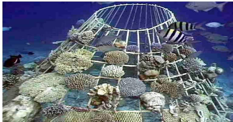
Fig. (6). Barnacle Reef, Maldives, 1997, in which \text{CaCO}_3/\text{Mg}(\text{OH})_2 were deposited onto steel conductive material.

growth enhancement. Recent studies that had tested these hypotheses Numerous authors [20, 39, 40, 59], although documenting high survivorship of attached coral branches, did not reveal an ubiquitous accelerated calcification by live corals, or resulted in lateral growth at the base of branches instead of a longitudinal increase.