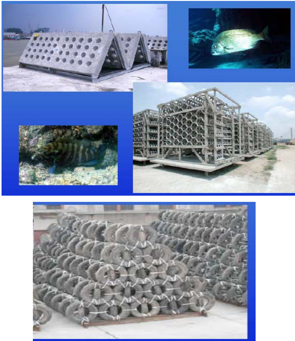
Fig. (3). Many of the huge variations in the engineering designs and applications of artificial reefs used for fisheries around the world.

(2) Fisheries: It includes huge variation in applications around the world and needs to question attraction and exploitation rates to ensure overfishing isn't the end result