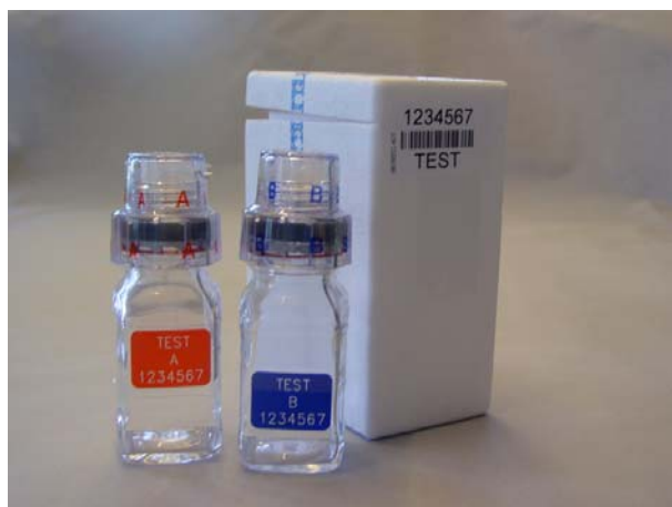
Picture (1). The BEREG kit used for uniquely identifying and sealing the blood samples.

The two whole blood or serum samples collected from the same athlete were sealed and designated as A and B. A BEREG kit (Berlinger Special AG) was used for uniquely identifying and sealing the blood samples (Picture 1). The BEREG kit contains one glass bottle with security cap A-sample (orange bottle label) and one glass bottle with security cap B-sample (blue bottle label). Each bottle is pre-sealed in transparent shrink-sleeve wrap with a tear-down-tag for easy opening. Every kit has a unique number, which is laser-engraved on the bottles and embossed on the caps. As soon as the bottle is closed properly, the sample is sealed and secure.