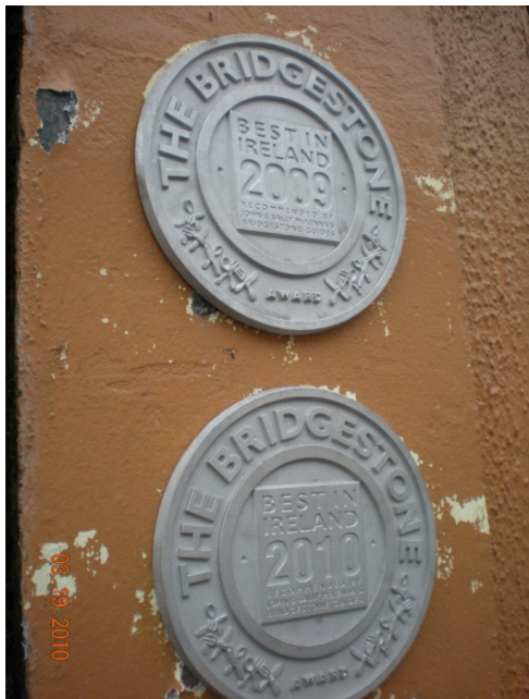
Fig. (9). Example of the award plaques which may be displayed if a restaurant owner pays a significant fee.

Geography: Place and Culture 100 Kilometer Radius defacto sourcing Stretching to include artisan produce Ireland International Scale dimensions market opportunities small scale producers Locals and Tourists willingness to pay knowledge varies Lack Irish food culture Motivation: Economic and Personal Quality of local products Producers cooperation meet chefs’ needs Consumers interest, knowledge Storage/Seasonality Creativity menu variety, adaptation Marketing artisan consumer expectation prize winning niche local plus art/creative local plus artisan/international Local Food Source and Promotion Intermediaries butchers regional, family business wholesale vegetables long supply chain Authenticity “local” not chef’s responsibility wholesaler excludes small scale local producers menu implies more than reality