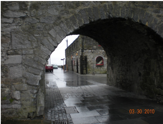
Fig. (6). Spanish Arch, built in 1584, represents historical influence of European trade with Ireland.

organic produce on the menu. Chef 5 worked in the longest-established of the restaurants (opened in the mid-1990s) and referred to the higher quality of local produce, to supporting local producers economically and to the convenience of having local suppliers. Chef 6 paralleled Chef 1, in owning more than one business and holding strong philosophical ideas relating to local food. Chef 6 has an eclectic style that is reflected in the restaurant, which incorporates both Irish and international cuisine. Chef 7 who works in a restaurant owned by an investor in the food and drinks sector, previously worked with Chefs 1, 3 and 6 and holds a degree in hotel and restaurant operations, as well as professional qualifications as a chef. The restaurant conveys a non-formal ambience and attracts a young clientele in the late evenings. It has a greater emphasis on using organic produce than have the others and a mission to use exclusively Irish food produce.