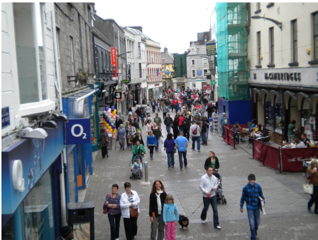
Fig. (4). Shop Street in Galway Ireland; all six surveyed restaurants are in close proximity to this main area of commerce.

Following review of recognized national food guides and the websites and menus of restaurants in Galway, six were identified which promote the use of local food in their kitchens (Fig. 4). Their seating capacity varied from 45-90 persons. Interviews were conducted with a key decision-maker in sourcing food in each restaurant: the owner, the manager, or the head chef. In one case both the owner and the chef were interviewed because they were jointly influential in determining the menu. All interviewees are referred to anonymously as Chef 1, Chef 2, etc., although several were managers or owners rather than chefs. The interview guide focused on the business profile and on the three research objectives. These components specifically allowed for gathering a broad range of information on chefs' perceptions and actions regarding local food, which illuminate the ways in which restaurants play a role in the development of local food value chains.