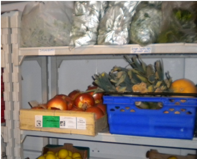
Fig. (8). Cold storage at restaurant includes both local “leaves” labeled on the top shelf and imported organic vegetables.

Some problems were identified associated with sourcing local produce, to which two responses emerged: replacement and adaptation. Additional cold storage was needed to compensate for less frequent deliveries of organic meat and vegetables by individual producers (Fig. 8). One chef referred to this factor and to price in rationalizing his shift from a local organic producer to a conventional wholesaler: “The larger multinational companies...could offer better prices, more discounts. We buy more from them now; better prices with same quality.” (This contrasts sharply to other interviewees who felt there was clear superiority to local organic vegetables.) This same chef also said that sometimes he had to buy French- or Icelandic-caught fish in winter because of the non-availability of required species from Irish fishermen. By contrast, other chefs adapted their menu to the fish species that were available on a given day. Chef 7 referred to the sense of adventure in planning a menu in advance when aspiring to use local food: “At first I changed menu every day according to what we ‘tripped over’ in the boxes...cooking off the bat like that. That was brilliant...we did that for all of December and then it got to the ‘like craggy months’ of Winter” and they were forced to develop a set menu from more conventional wholesale suppliers.