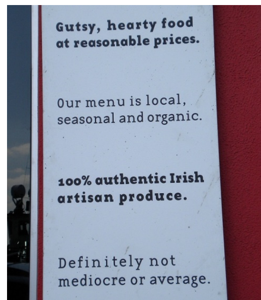
Fig. (5). Restaurant sign advertises their perceived importance of local and organic food.

Five male and two female chefs were interviewed. One was aged 45-54 years; the others were aged 25-34 years. Two held professional qualifications in cooking and in catering, respectively; the others held a range of other qualifications. With one exception, the restaurants were established in 2008-09, as economic recession was impacting in Ireland. This apparently inauspicious timing appeared to have been influenced by falling rents and properties becoming available. A deep interest in food, in local ingredients, and in demonstrating use of those ingredients were the reasons cited for opening and working in the restaurants, as described by one chef: "I wished to stay in Galway...to showcase food from round Galway. A lot of people are creating fantastic food and ingredients and no one is showcasing them in a proper way." (Fig. 5). The chefs are profiled briefly in order to contextualize the analysis of their narratives. They are numbered in order of interview.