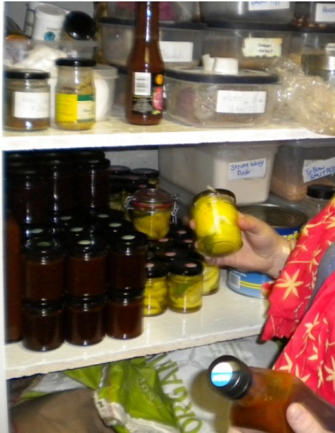
Fig. (7). Chutneys and preserves made by Chef 7.

West Cork [50]. Local was also extended to include artisanal produce from other European countries, an international dimension less well documented in published literature. Grains, lentils, chickpeas and wines were sourced through specialty importers. Thus Chef 7 described: "Flour is organic...buy in England if cannot get in Ireland...organic pasta...barley from the UK." Two restaurants imported wine through agents who dealt with specialty producers in Italy, Spain and New Zealand.