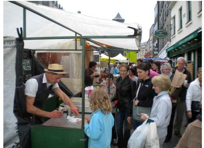
Fig. (2). Galway Farmer’s Market with produce, artisan and local foods (here Donuts).

food products (air dried beef and lamb) are available. Connemara lamb from a mountainous area northwest of Galway City, holds a European Union (EU) Protected Geographical Indication (PGI) quality food label [48]. There are a handful of farm cheese producers and a small but growing number of organic vegetable and beef producers located in County Galway and in the adjoining counties of Roscommon and Clare. A traditional weekly farmers’ market is frequented by a wide range of small scale food producers and processors (Figs. 2, 3).