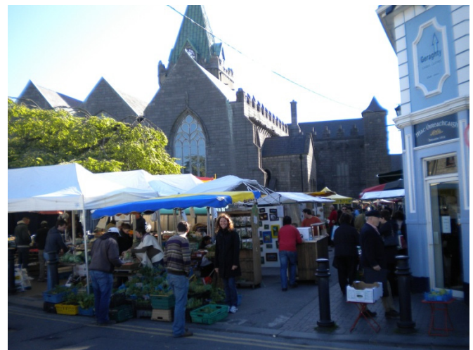
Fig. (3). Galway Farmers’ Market is weekly, year around.

Galway has a well educated middle-class resident population with disposable income. It also has a developed tourist market and substantial demand for dining out, which is met by over 135 restaurants (there are also as many as pubs which serve food). A small number of these restaurants advertise their use of local produce and are recognized for doing so in national and international food guides.