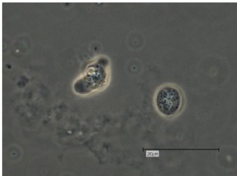
Fig. (4). V. vermiformis trophozoite and cyst; Bar: 20 \mu m; phase contrast.

Molecular-based analyses of V. vermiformis are limited to sequencing of the 18S rRNA gene, which is used as a phylogenetic marker for taxonomic inferences [10]. Those 18S