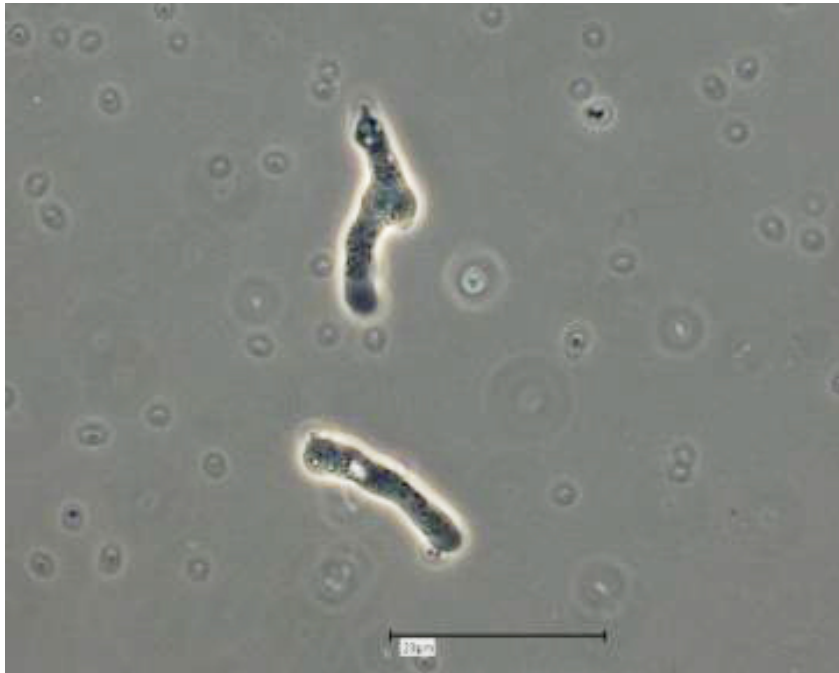
Fig. (1). V. vermiformis trophozoites, showing the typical monopodial morphology; amoebal saline; Bar: 20 \mu\text{m} ; phase contrast.

monopodial form (Fig. 1) in locomotion, some of them with uroidal filaments (Fig. 2). These uroidal filaments weren't reported in early studies [3]. Granulae are visible within the cytoplasm as well as a small anterior hyaline zone [10, 15]. In general, morphological features seem to vary among the strains, determined by the environmental conditions. The trophozoites are usually monopodial. However, they may show several pseudopodia and irregular shapes, especially when moving in another direction (Fig. 3).