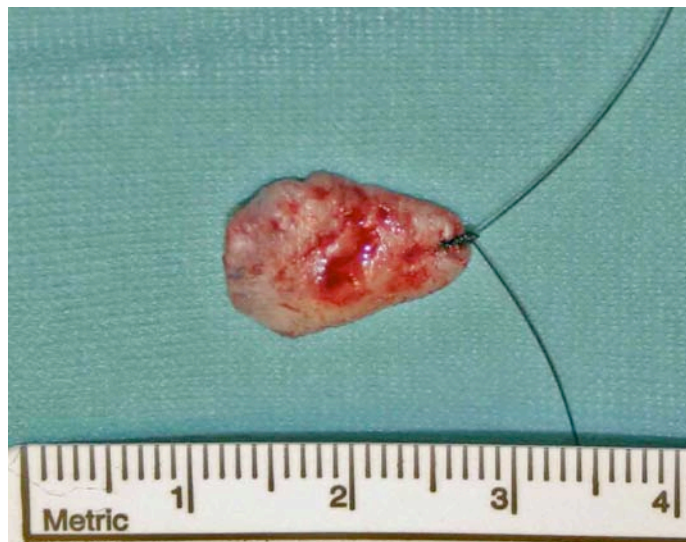
Fig. (4). Resected specimen (two cm diameter approximately).