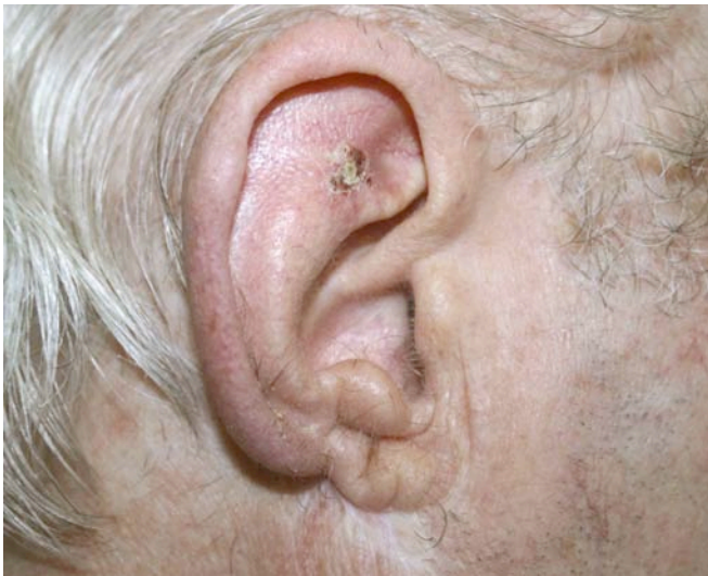
Fig. (1). Squamous-cell carcinoma involving the right ear triangular fossa.

procedures. In 1985 Dr. Elshahy from Atlanta described a rotation-advancement composite flap from the antehelix, which included skin, perichondrium and cartilage [1]. In