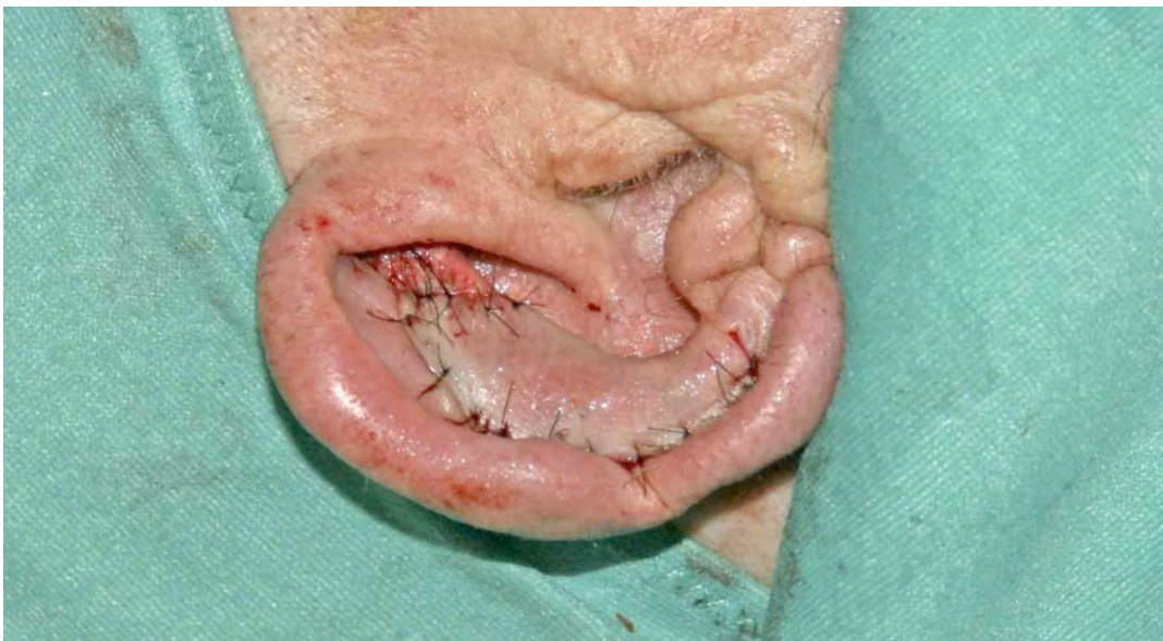
Fig. (7). Early post-op view showing adequate defect coverage.

Microsurgical instruments, loops or other magnification devices are mandatory to approach this critical step. Microsurgical technical skills are required.