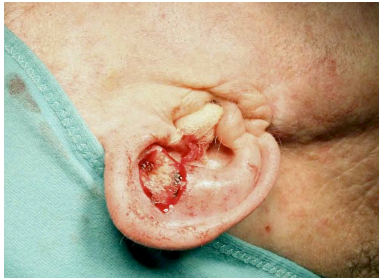
Fig. (3). Composite skin and perichondrium defect after malignancy resection.