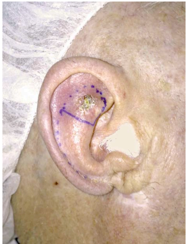
Fig. (2). Pre-operative planning including malignancy resection and flap design.

represent a challenging problem for the plastic or maxillo-facial surgeon. Over the years just a few specific local reconstructive techniques have been proposed as possible