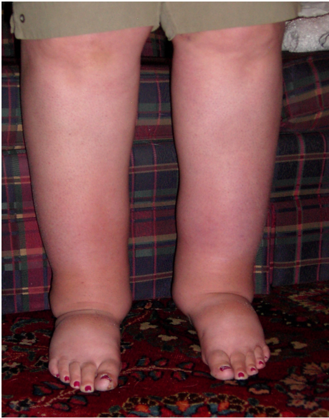
Fig. (3). Patient at beginning of CDT treatment.