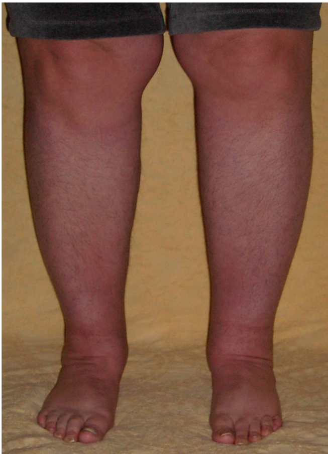
Fig. (4). Patient at 2 year follow-up.