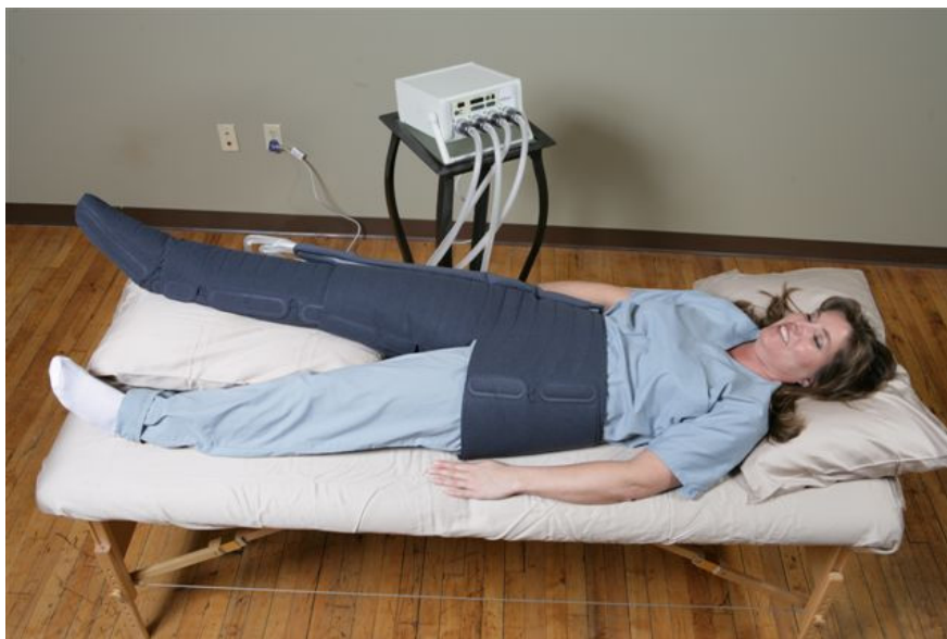
Fig. (1). The Flexitouch system for the lower extremity on a model.

The Flexitouch system consists of an electronic controller unit connected by tubing harnesses to specially designed garments that wrap and contour around the affected limb and adjacent trunk. The unique sequencing of the 30-32 individual chambers, the work and release action of the gentle dynamic pressure, and its timing are all compatible with lymphatic anatomy and physiology and the principles of MLD. Treatment begins with individual chamber inflation and immediate deflation in peristaltic-like cycles of 1-3 second duration surrounding the trunk. The design of the garments and chambers link anastomoses between neighboring lymphatic drainage regions. The sequenced gradient pressure is applied to the truncal and more proximal areas first to prepare for the augmented flux of lymph towards intact lymph vessels; thereafter, lymph drainage of