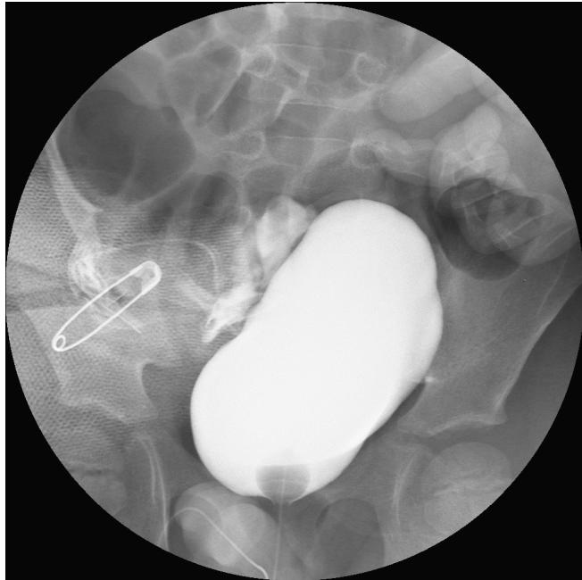
Fig. (3). A cystogram on the 6 th post-operative day showing a mass effect with the leakage of contrast on the right lateral aspect of the bladder.

posteriorly. The uppermost part of the urogenital sinus develops into the urinary bladder whose dome connects to the allantois by the epithelialized urachus. The urachus elongates as the bladder descends, and eventually obliterates by the fifth to the seventh month of gestation, leaving behind a three to ten centimeter fibrous remnant (the median umbilical ligament) extending from the bladder dome to the base of the umbilicus [1,2]. The urachus may merge with one or both remnants of the umbilical arteries (the medial umbilical ligaments) and becomes deviated either left or right.