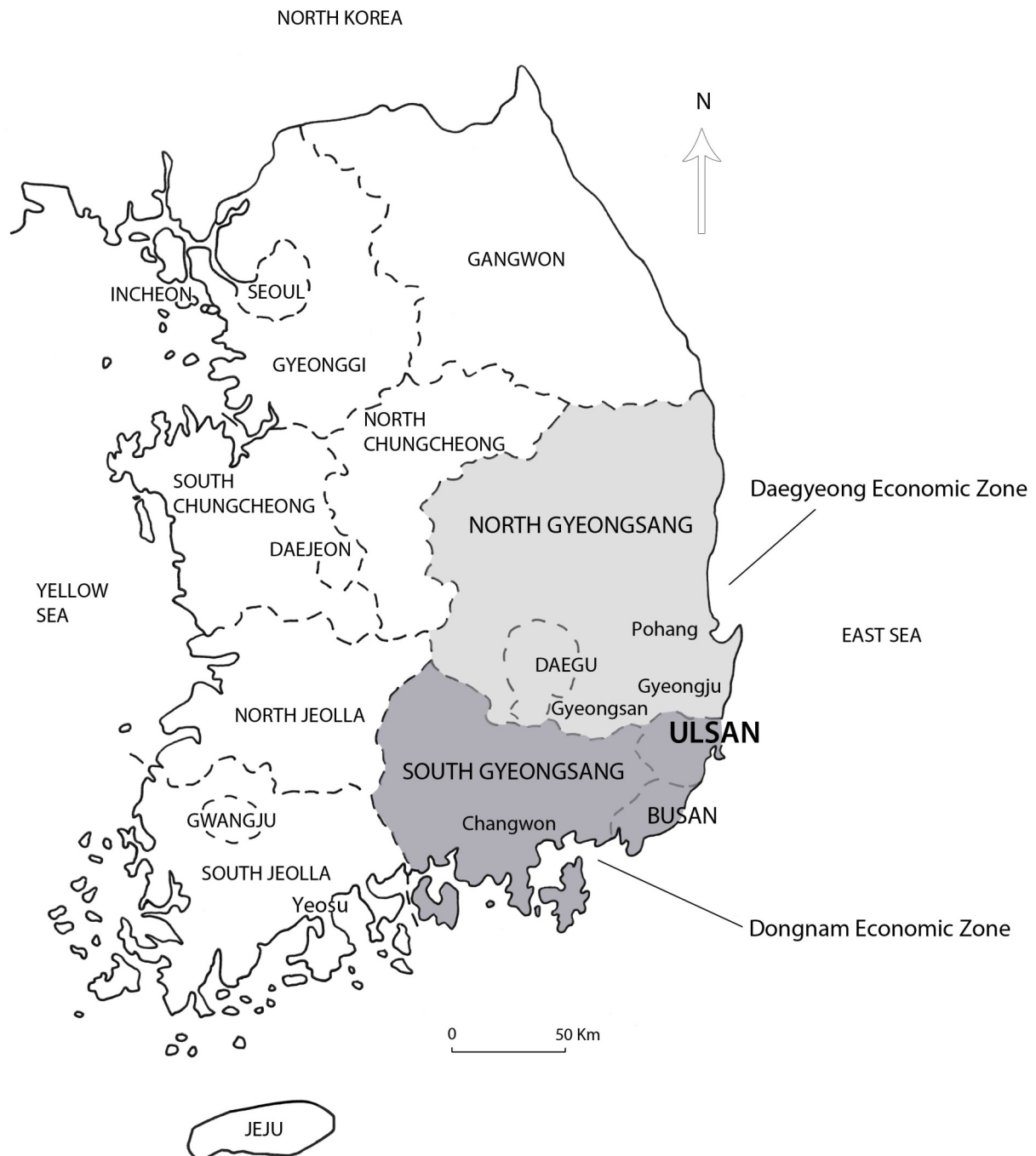
Fig. (1). Ulsan among South Korea's Provinces and Special Cities.

Ulsan Metropolitan City is situated along the East Sea, within South Korea's newly defined Dongnam (Southeast) Economic Zone and the larger Gyeongsang Region. As shown in Fig. (1), the latter also includes the Daegyeong