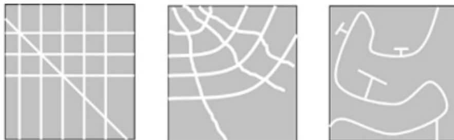
Fig. (3). Legibility of street networks.

In addition, the role of “self-selection” in travel behaviour is gradually being introduced in recent transportation studies [13, 54-57]. Self-selection refers to “the tendency of people to choose locations based on their travel abilities, needs and preferences” [58]. It is possible