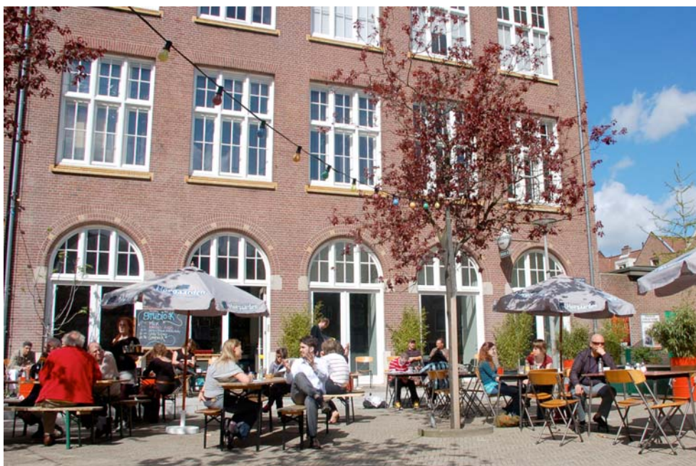
Fig. (2). Terrace of Studio K.