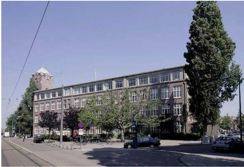
Fig. (1). The Timorplein Community Building.

The role of students in the Indische neighborhood remains outspoken in Studio K, a large building located on one of the renovated neighborhood squares called