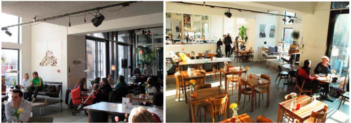
Fig. (4). Studio K the interior.

educated middle class and have grown up in an environment that cherishes art, education and music. They are the kind of people that search for upcoming, cultural events and experience them as open space.