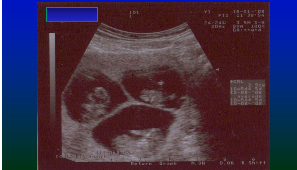
Fig. (2). A transvaginal sonogram showing a tri-chorionic tri-amniotic triplet gestation, 11wks, generated by ICSI/IVF; Each fetus is in a separate amniotic sac. This pregnancy ended in a successful Caesarean delivery at 33 weeks of healthy 1800, 1700, & 1600gr neonates.

A transvaginal sonogram showing a tri-chorionic tri-amniotic triplet gestation, 11wks, generated by ICSI/IVF; Each fetus is in a separate amniotic sac. This pregnancy ended in a successful Caesarean delivery at 33 weeks of healthy 1800, 1700, & 1600gr neonates.